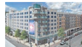
AC Marriott Hotel

Hospitality Deal of the Year goes to AC Marriott Hotel Cincinnati at The Banks. The AC Hotel Cincinnati at The Banks is a 171-room, upscale Marriott-branded hotel located on a 0.87 acre parcel in the heart of The Banks entertainment district. The AC Hotel completes the build-out of Phase I of The Banks along Joe Nuxhall way, immediately west of Great American Ballpark. Delivered in October 2017, the 113,000 SF hotel features European style finishes, with a contemporary interior, a 3,000-sf rooftop bar with sweeping views of the Ohio River.