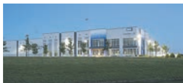
Park North at Monroe

Industrial Deal of the Year goes to Park North at Monroe. In October of 2015, IDI Gazeley announced it would deliver Park North at Monroe Building 8, Greater Cincinnati's largest speculative industrial facility to date. Hayneedle.com would announce their intention to lease the entire facility in January 2017. This deal was a win-win for the State of Ohio, Warren County, the City of Monroe, Hayneedle.com and IDI Gazeley as new jobs were created and an existing company re-invested in our region.